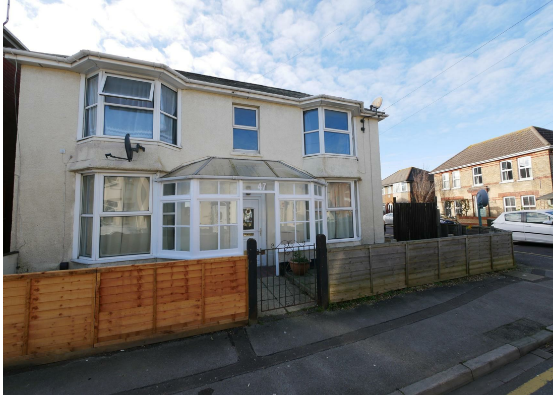
47 Portman Road , Bournemouth, BH7 6EX