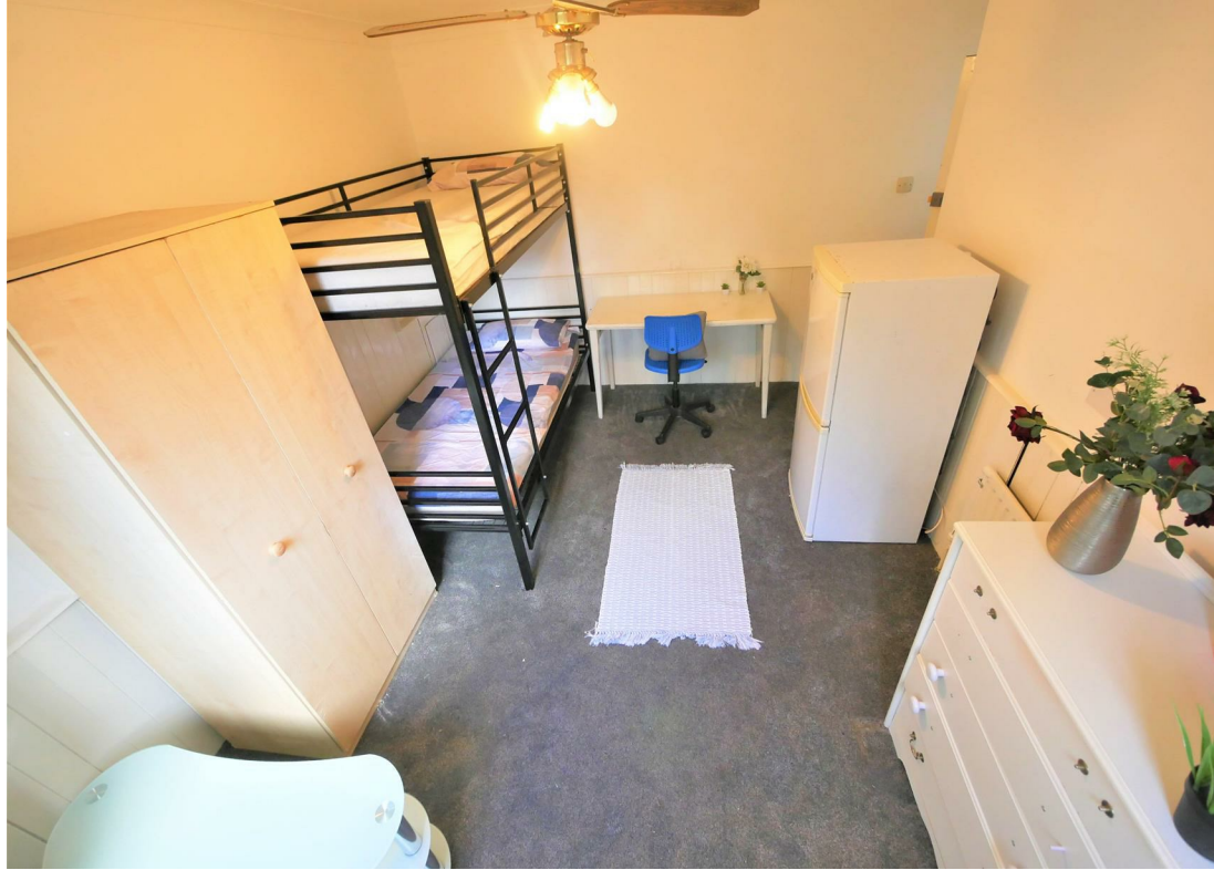
25 Spencer Road , Bournemouth, BH1 3TE